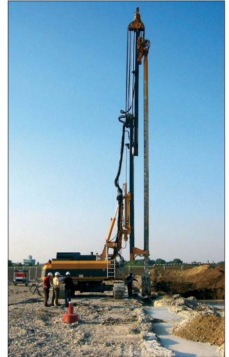
The cut-off wall was erected with a trench cutter using the CSM technique. In an alternating construction sequence the ground was loosened and mixed in situ with the slurry suspension.

The cut-off wall presents the main item of the site stabilisation since it prevents groundwater flow from the hot spot. Bauer Spezialtiefbau erected the 450 m long wall using the cutter-soil-mixing technique (CSM). The groundwater is collected in a deep bed drainage system and extracted from four wells. After treatment, the cleaned water is re-infiltrated in infiltration reservoirs on the other side of the cut-off wall.