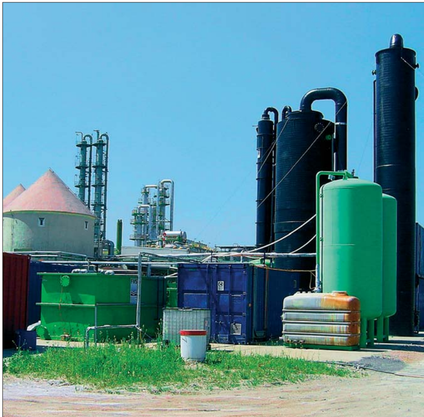
The pilot phase required an adaptable water treatment plant which could be operated flexibly. During pilot operation, parameters for the design of the long-term plant were obtained.

A fraction of the contaminated water is directed to a research plant operated by the Centre for Environmental Research Leipzig-Halle. There, scientists investigate the microbiological degradation of MTBE within the framework of the METLEN research project.