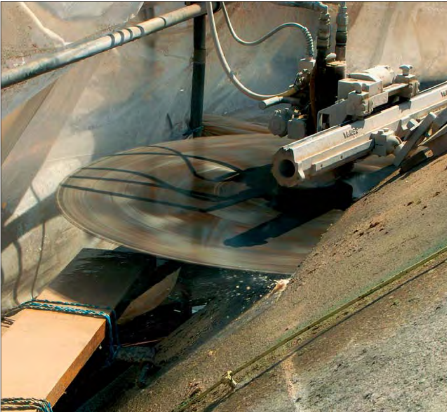
The water produced during the cutting process was collected and directed to a treatment plant where the concrete sludge was removed.

works, the material will be used to re-fill the excavations.