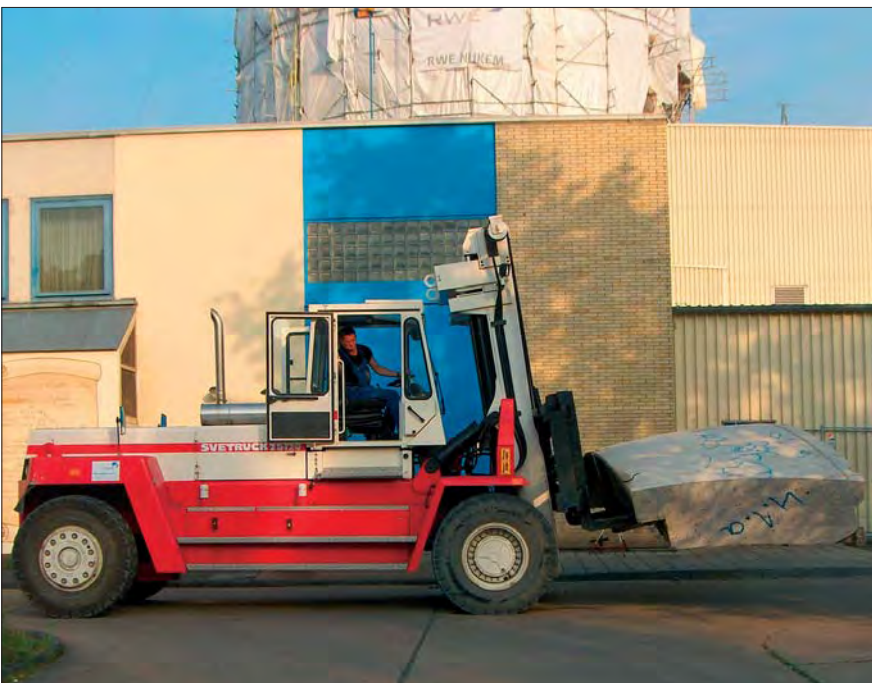
A fork-lift truck transported the bisected segments still weighing 25 tonnes to the crushing plant. After the completion of the dismantling works, the crushed material will be used to re-fill the excavations.