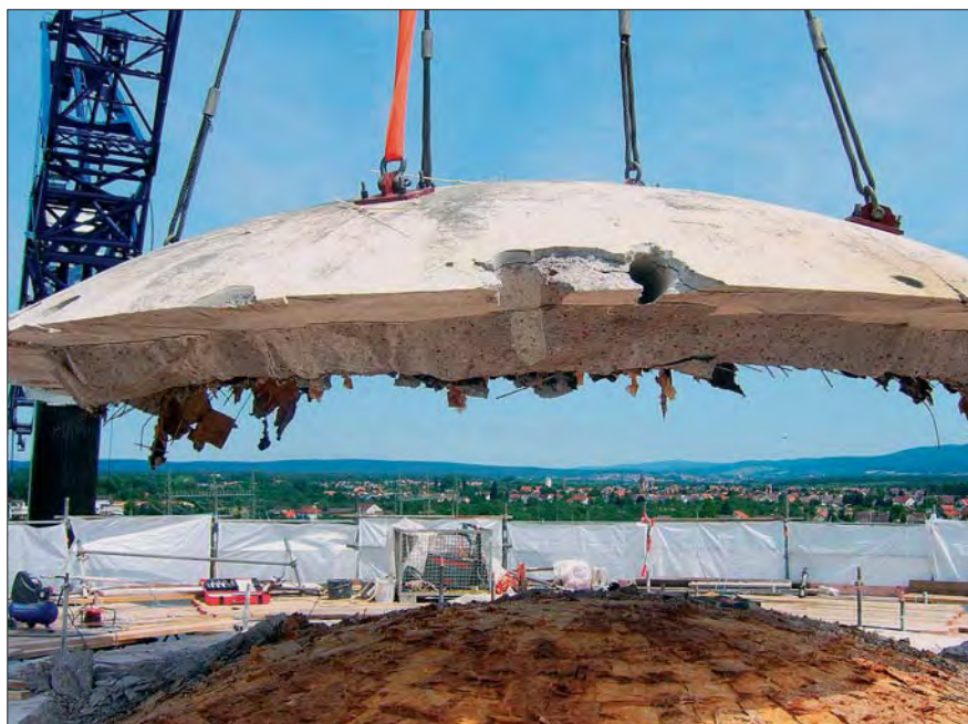
The dismantling concept developed by BAUER Environment group planned the segmentation of the concrete dome by hydraulic cutting and pressing. The segments, weighing 50 tonnes each, were lifted down with the aid of a truck crane.

The reactor building was 26 m high with an outer diameter of 15 m. Beneath the 0.7 m thick concrete shell a 5 cm thick